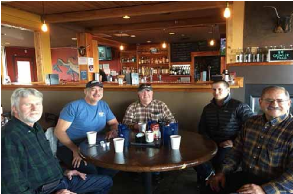
Saturday Morning Fly-out: Still good weather in November: 3 Aircraft 5 Souls at the Hub at TIW